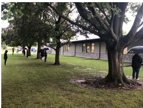
Surrounding our school in prayer.

Labels: Just a reminder to label all uniform items! It is amazing how quickly sweaters and other uniform items are misplaced and if they are all properly labeled we can give them back to proper owner.